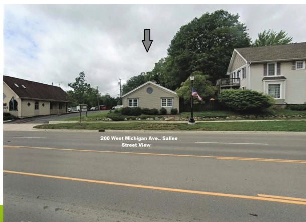
MI Ave View